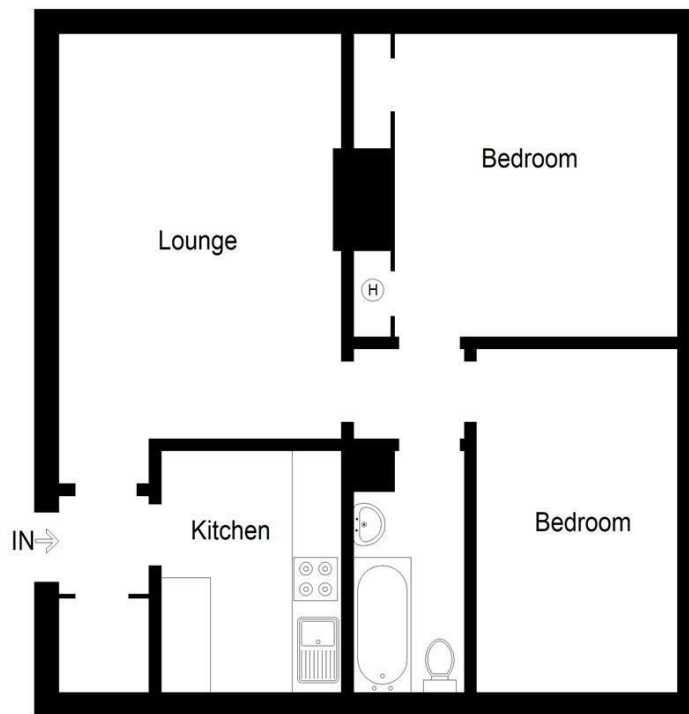
Illustration For Identification Purposes Only. Not To Scale (ID1170140 / Ref:90031)