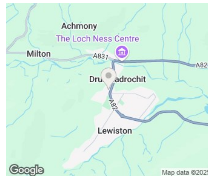
Illustration For Identification Purposes Only. Not To Scale (ID:1160362 / Ref:89836)