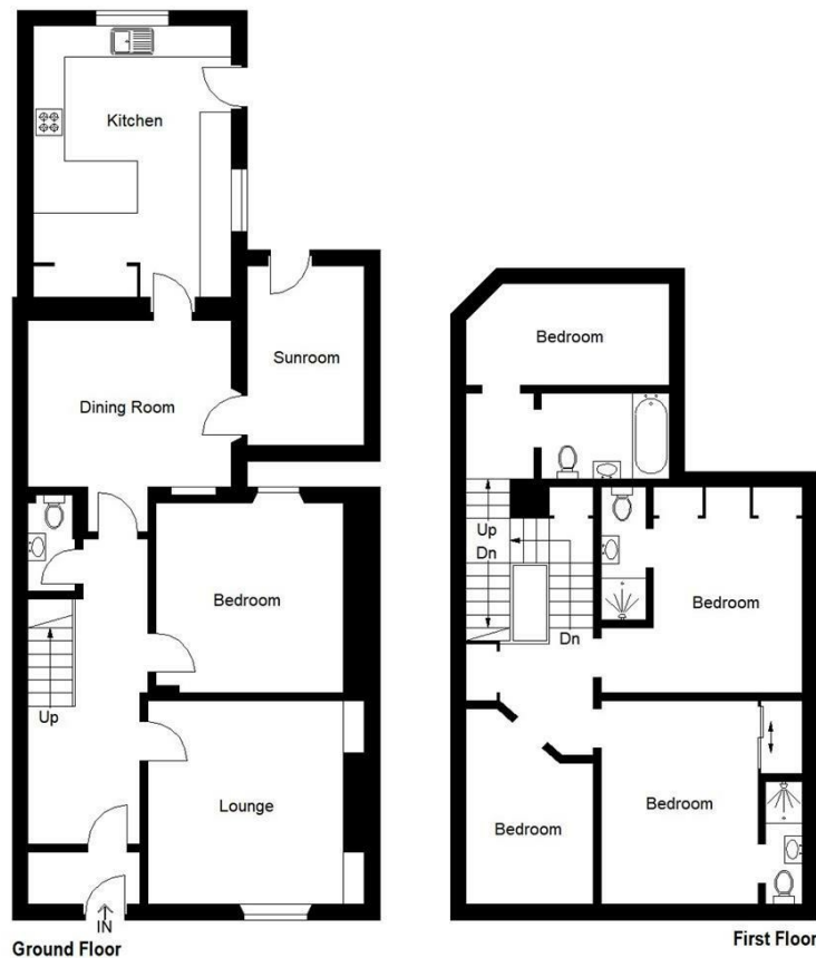
Illustration For Identification Purposes Only. Not To Scale (ID:952765 / Ref:84330)