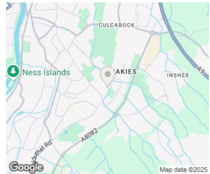
Illustration For Identification Purposes Only. Not To Scale (ID:1162510 / Ref:89893)