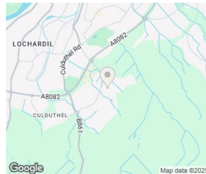
Illustration For Identification Purposes Only. Not To Scale (ID1161441 / Ref:89862)