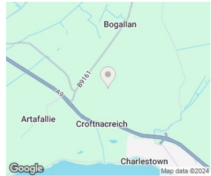
Illustration For Identification Purposes Only. Not To Scale (ID1128304 / Ref.89319)