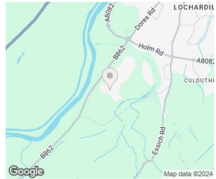
Illustration For Identification Purposes Only. Not To Scale (ID:1121934 / Ref:89170)