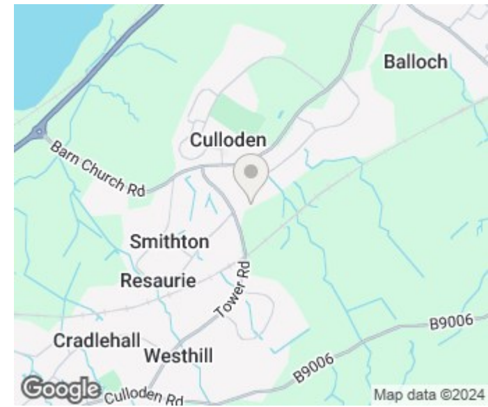
Illustration For Identification Purposes Only. Not To Scale (ID1119056 / Ref:89067)