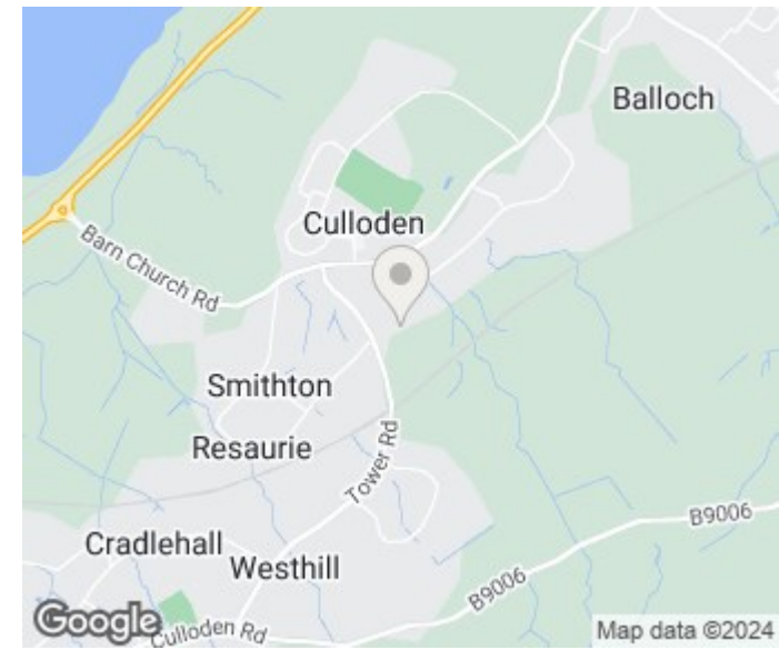
Illustration For Identification Purposes Only. Not To Scale (ID1119056 / Ref:89067)