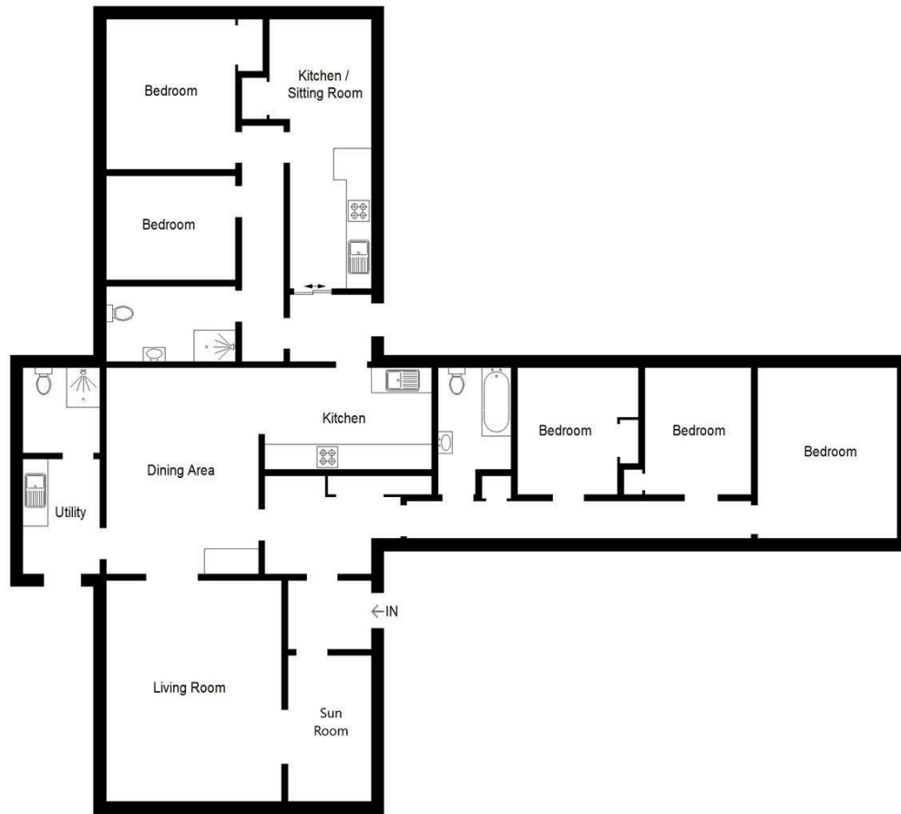
Illustration For Identification Purposes Only. Not To Scale (ID:1117364 / Ref:89017)