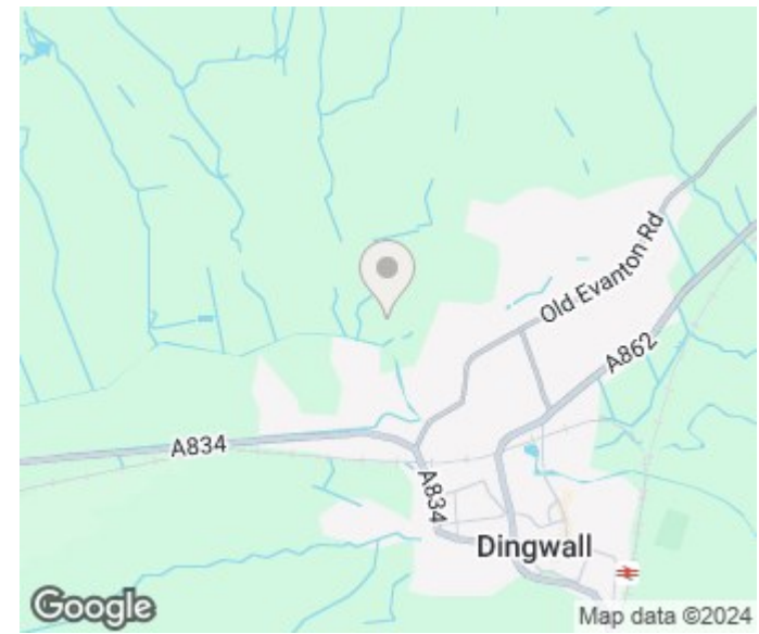
Illustration For Identification Purposes Only, Not To Scale (ID1116160 / Ref:88990)