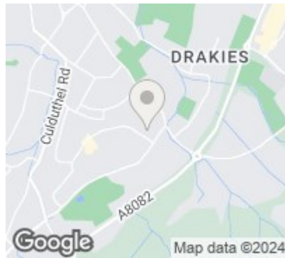
Illustration For Identification Purposes Only. Not To Scale (ID:1092394 / Ref:88347)