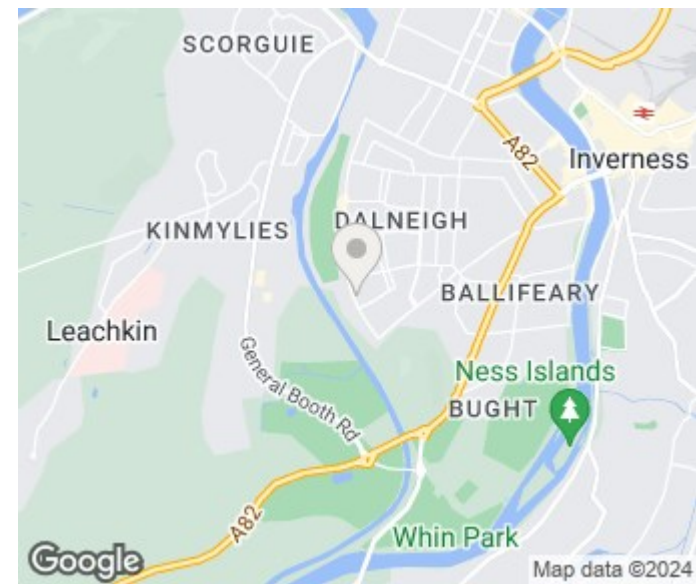
Illustration For Identification Purposes Only. Not To Scale (ID1097745 / Ref:88463)