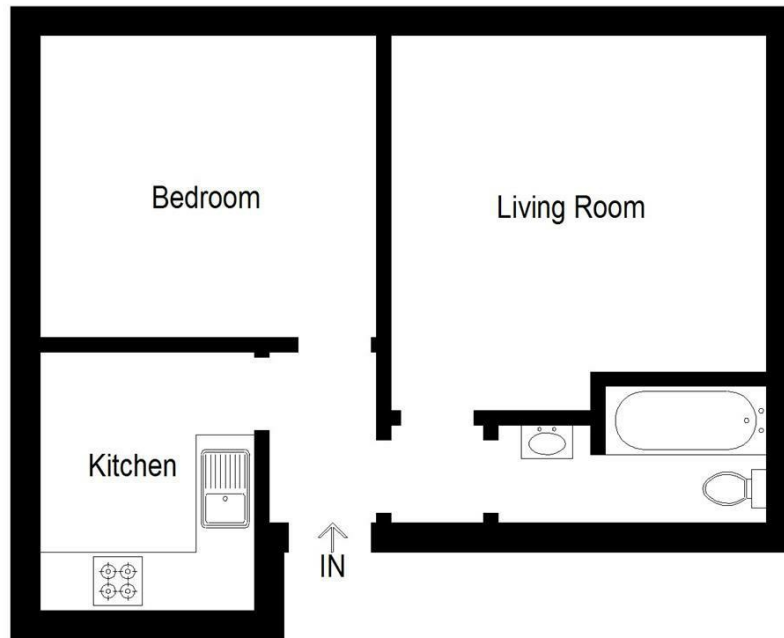
Illustration For Identification Purposes Only. Not To Scale (ID:1087409 / Ref:88182)