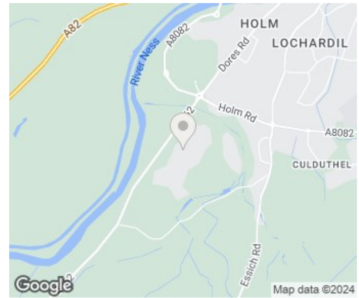
Illustration For Identification Purposes Only. Not To Scale (ID:1081651 / Ref:88033)