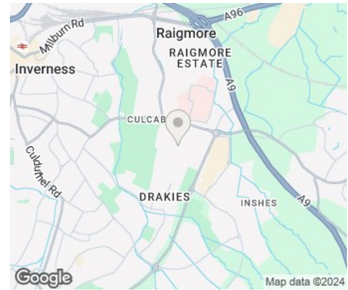
Illustration For Identification Purposes Only. Not To Scale (ID:1079676 / Ref:87985)