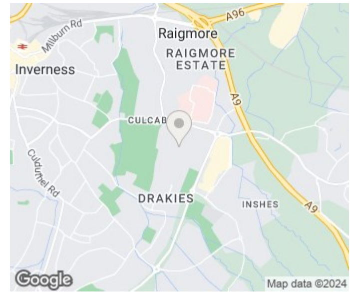
Illustration For Identification Purposes Only. Not To Scale (ID:1079676 / Ref:87985)