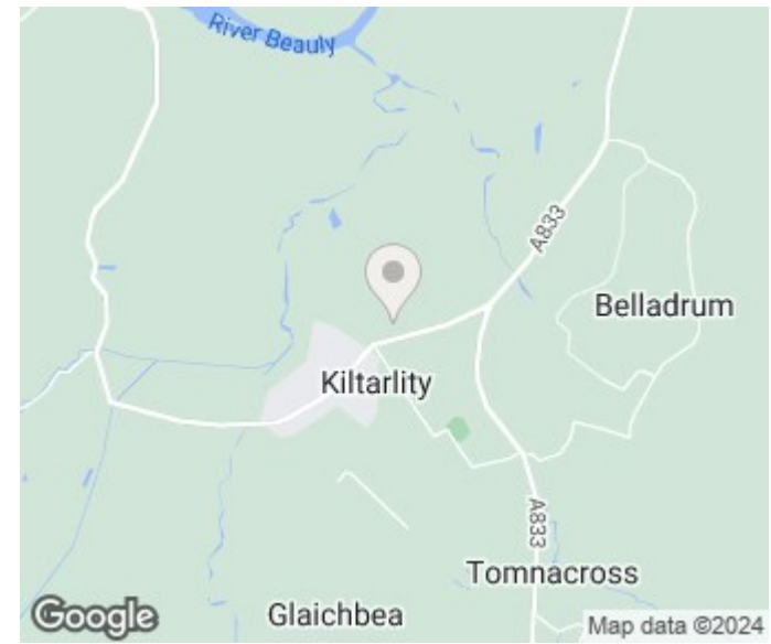
Illustration For Identification Purposes Only. Not To Scale (ID:1075571 / Ref:87870)