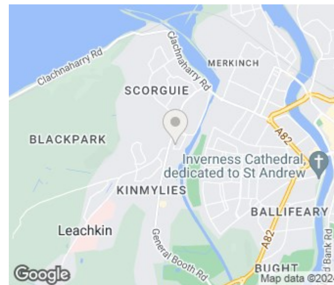
Illustration For Identification Purposes Only. Not To Scale (ID:1072234 / Ref:87761)