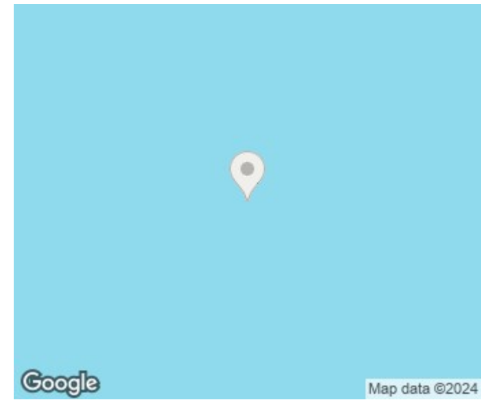
Illustration For Identification Purposes Only. Not To Scale (ID1063711 / Ref:87550)