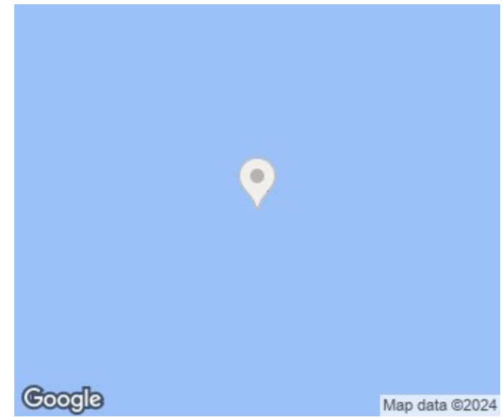
Illustration For Identification Purposes Only. Not To Scale (ID1063711 / Ref:87550)