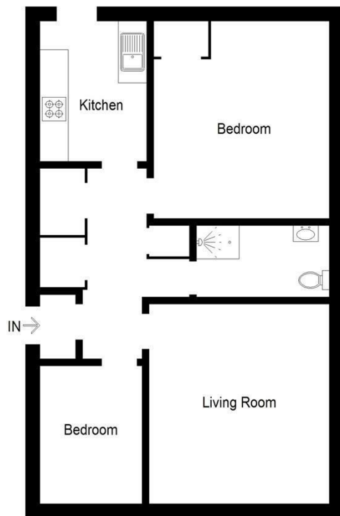
Illustration For Identification Purposes Only. Not To Scale (ID:1031900 / Ref:86772)