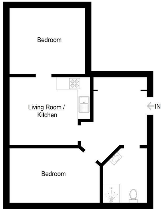
Illustration For Identification Purposes Only. Not To Scale (ID:1014210 / Ref:86288)