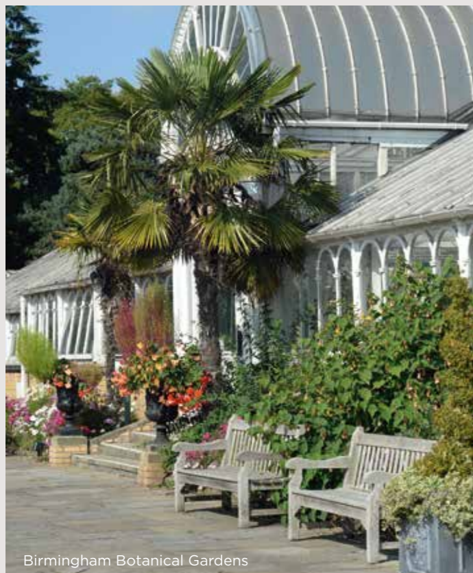
Birmingham Botanical Gardens