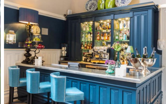
Audley Binswood, Binswood Avenue, Leamington Spa, CV32 5SE