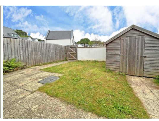
Agents Note: Whilst every care has been taken to prepare these sales particulars, they are for guidance purposes only. All measurements are approximate are for general guidance purposes only and whilst every care has been taken to ensure their accuracy, they should not be relied upon and potential buyers are advised to recheck the measurements. West of Exe is a trading name for East of Exe Ltd, Reg. no. 07121967