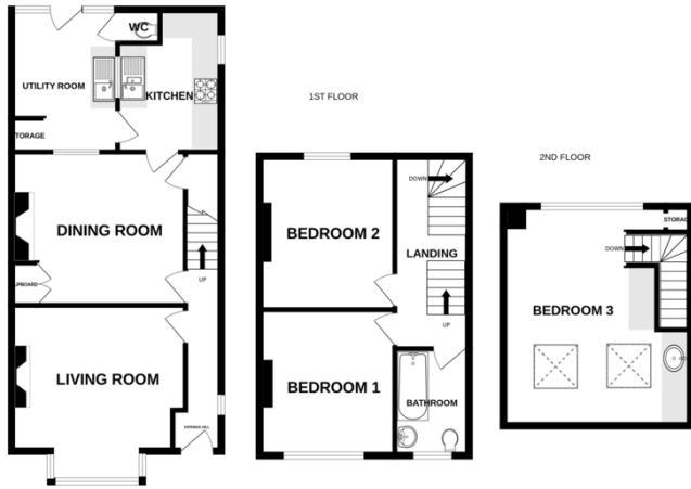
Measurements are approximate. Not to scale. Illustrative purposes only Made with Metropix ©2024