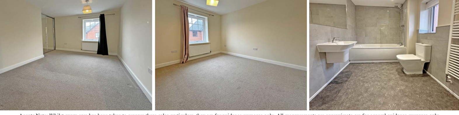
Agents Note: Whilst every care has been taken to prepare these sales particulars, they are for guidance purposes only. All measurements are approximate are for general guidance purposes only and whilst every care has been taken to ensure their accuracy, they should not be relied upon and potential buyers are advised to recheck the measurements. West of Exe is a trading name for East of Exe Ltd, Reg. no. 07121967