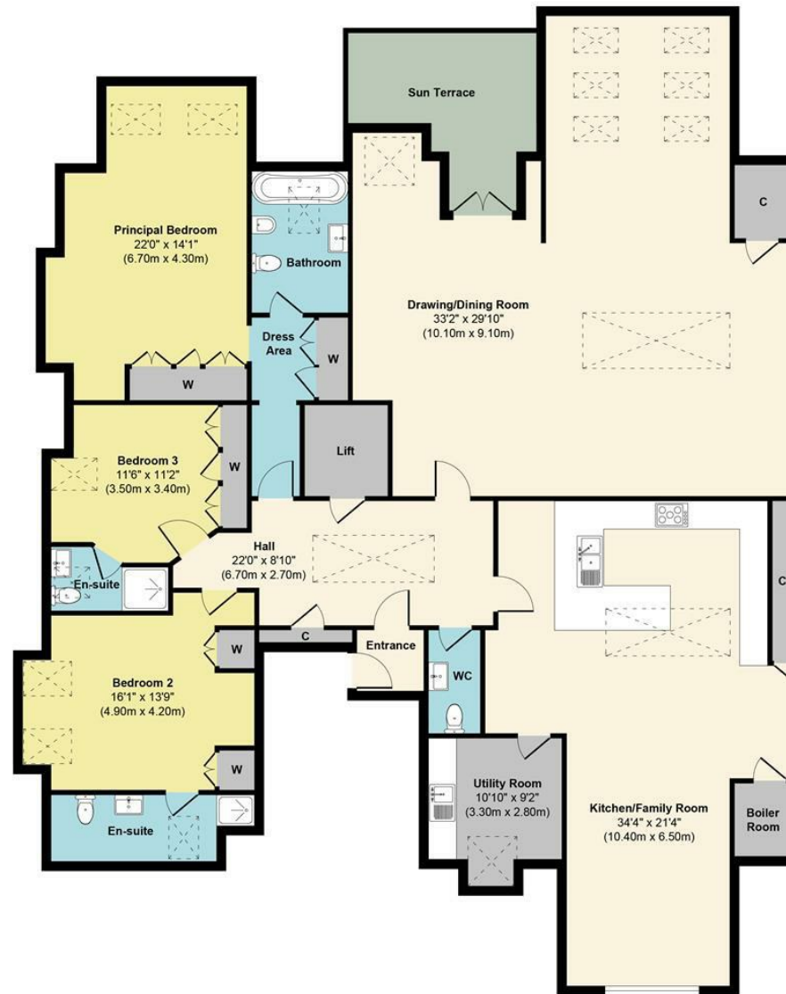
Approx. Gross Internal Floor Area 2850 sq. ft / 264.80 sq. m

All measurements are approximate and quoted in metric with imperial equivalents and for general guidance only and whilst every attempt has been made to ensure accuracy, they must not be relied on. The fixtures, fittings and appliances referred to have not been tested and therefore no guarantee can be given and that they are in working order. Internal photographs are reproduced for general information and it must not be inferred that any item shown is included with the property.