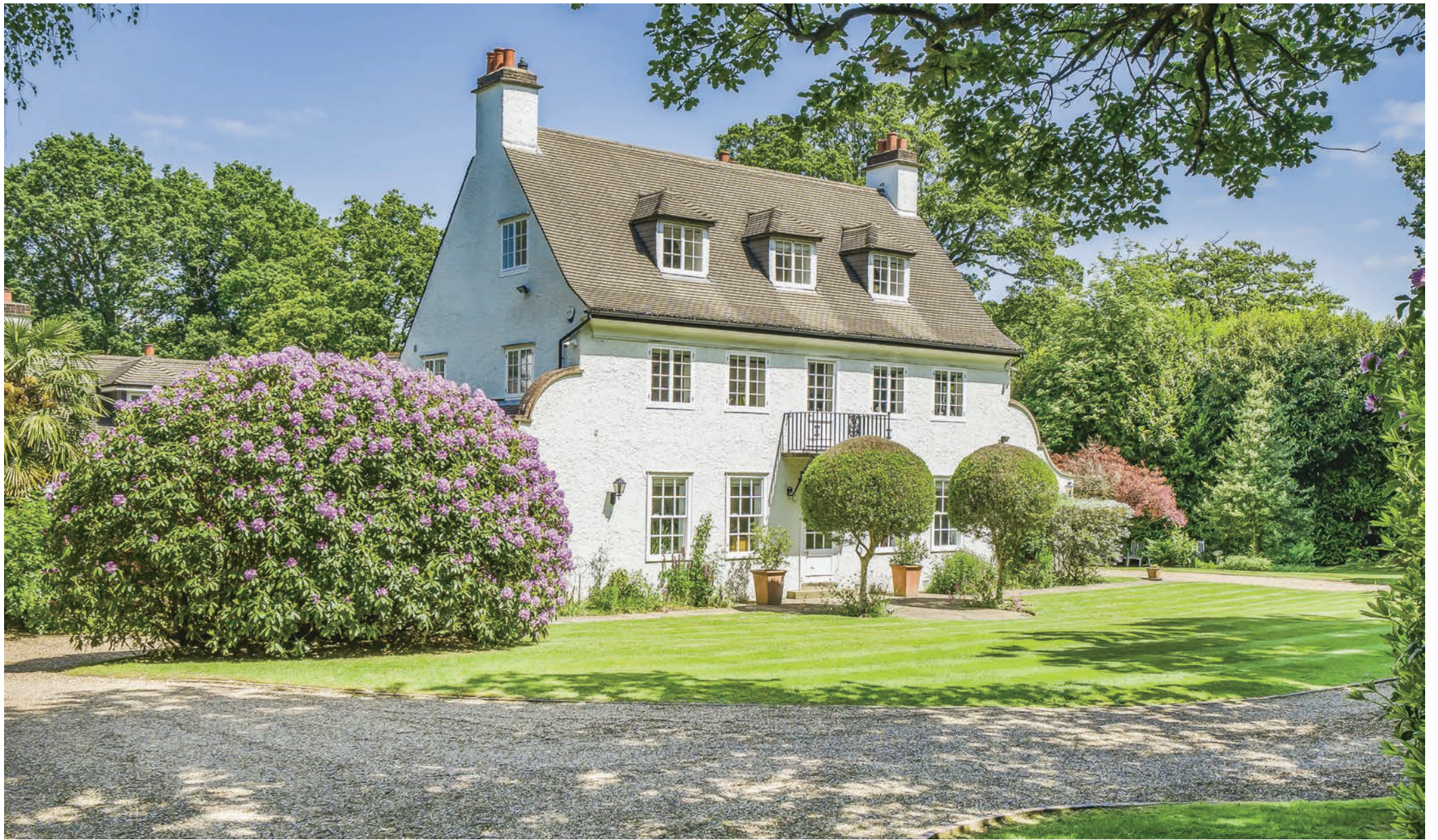
Glade House The Glade | Kingswood | Surrey | KT20 6LL