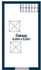
Garage First Floor

Beith is a small town situated in the Garnock Valley approximately 20 miles southwest of Glasgow. Local amenities include primary and secondary schooling, Beith Primary and Garnock Academy, a golf course, bowling club and local shops, restaurants and bars nearby. For those commuting Glengarnock Train Station is only a few minute's drive away and offers a frequent service to Glasgow / Ayr. Braehead shopping centre is a 20 minute drive away.