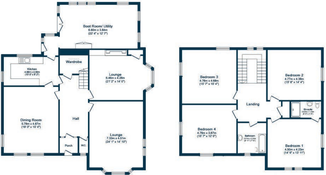
Ground Floor First Floor