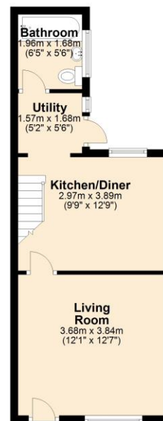
Ground Floor Approx. 32.3 sq. metres (347.7 sq. feet)