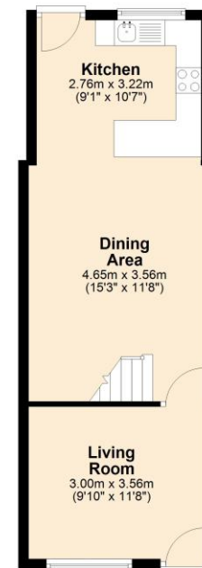
Ground Floor Approx. 36.8 sq. metres (396.1 sq. feet)