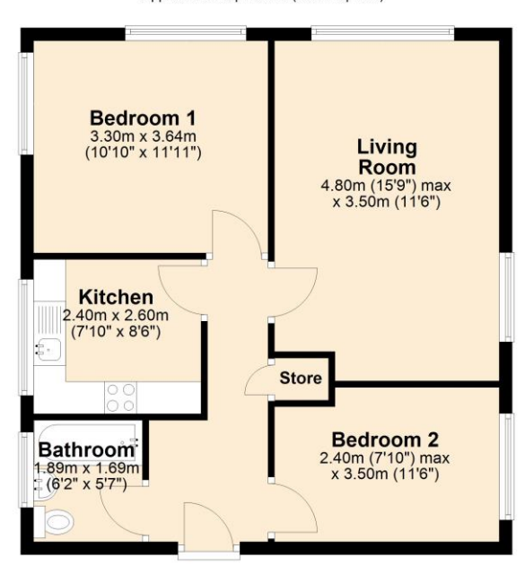
Ground Floor Approx. 55.3 sq. metres (595.7 sq. feet)

Total area: approx. 55.3 sq. metres (595.7 sq. feet)