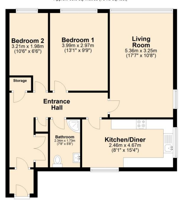
First Floor Approx. 68.0 sq. metres (731.5 sq. feet)

Total area: approx. 68.0 sq. metres (731.5 sq. feet)