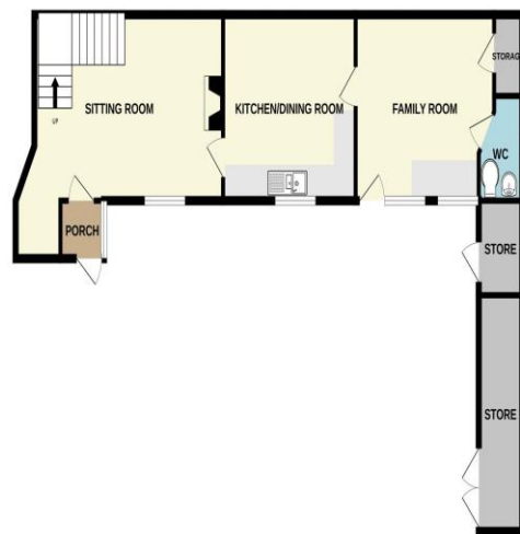
GROUND FLOOR 678 sq.ft. (63.0 sq.m.) approx.