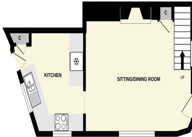
GROUND FLOOR 294 sq.ft. (27.3 sq.m.) approx.