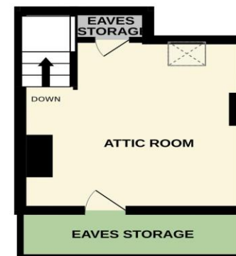
2ND FLOOR 131 sq.ft. (12.2 sq.m.) approx.