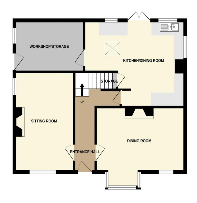
1ST FLOOR 517 sq.ft. (48.0 sq.m.) approx.

GROUND FLOOR 676 sq.ft. (62.8 sq.m.) approx.