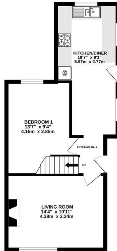
GROUND FLOOR 461 sq.ft. (42.9 sq.m.) approx.