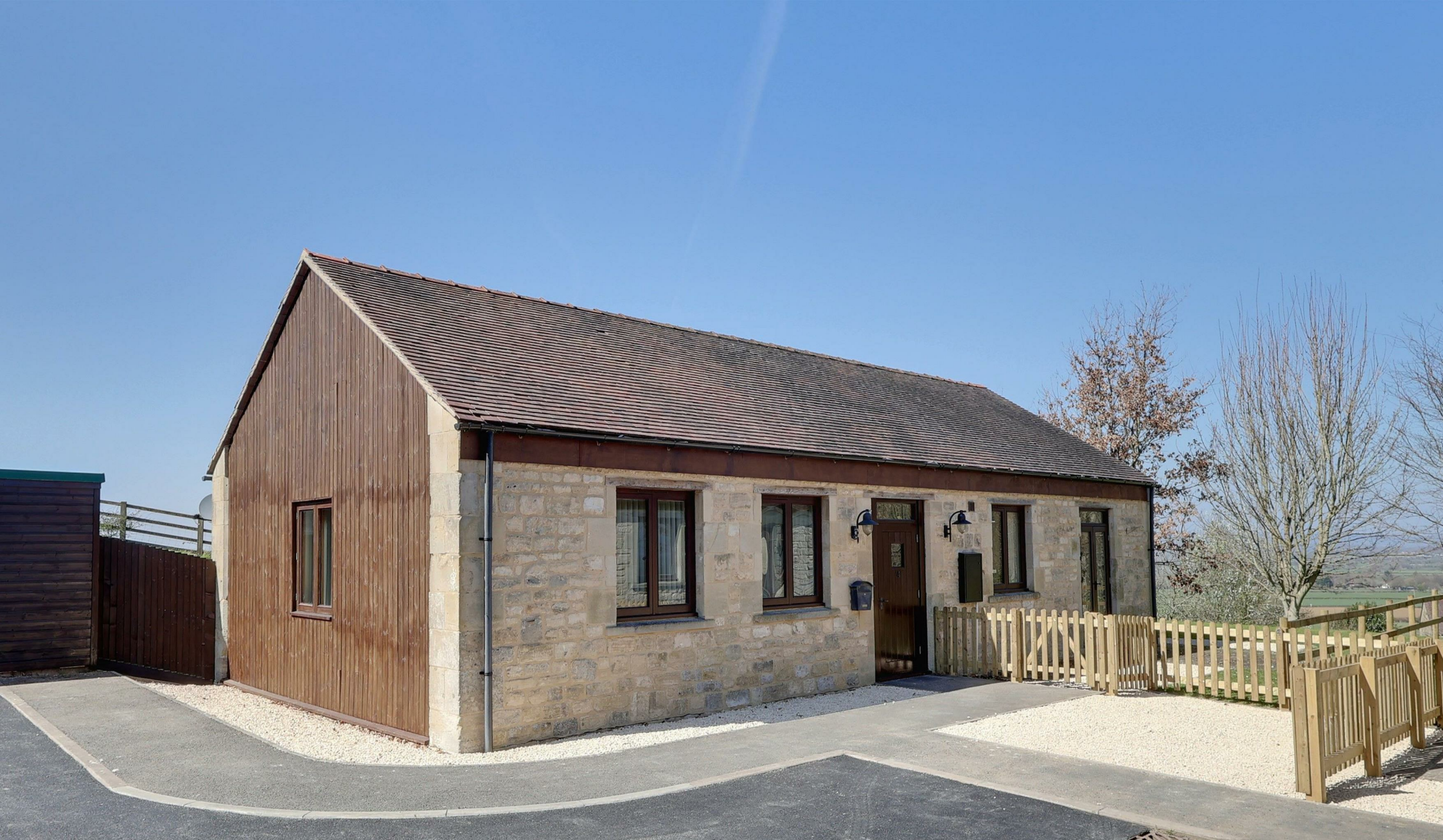
Frocester Hill, Frocester GL10 3TP £425,000