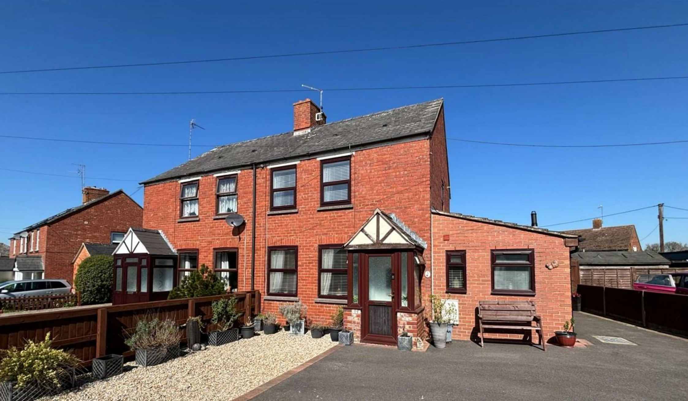
Alkerton Terrace, Eastington GL10 3AU £398,500