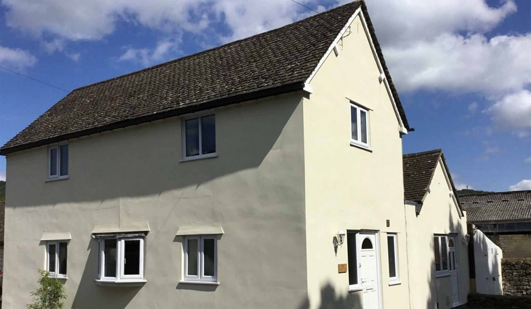
Oak Cottage , Stroud GL5 4BD No Price