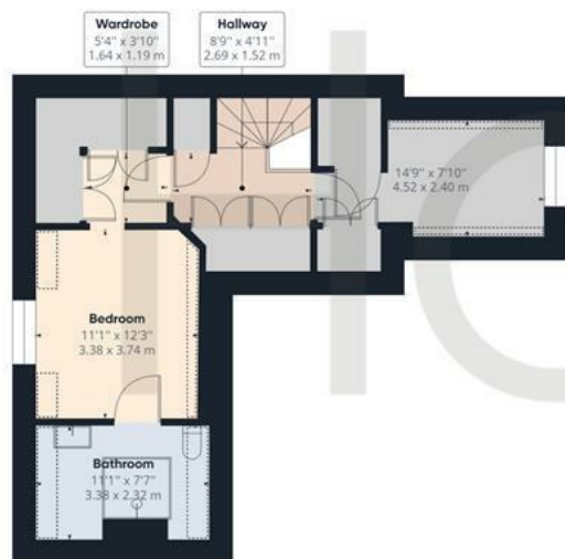
Floor 2 Building 1