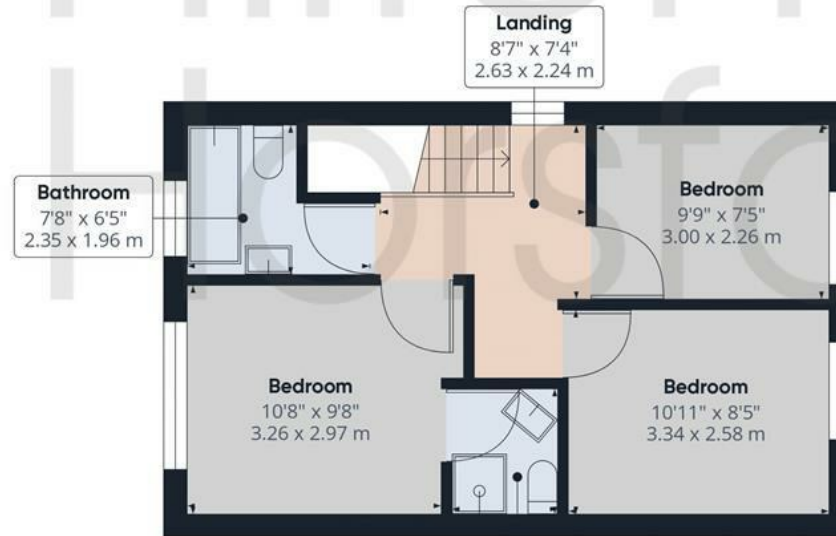
En-suite 4'7" x 5'5" 1.41 x 1.66 m