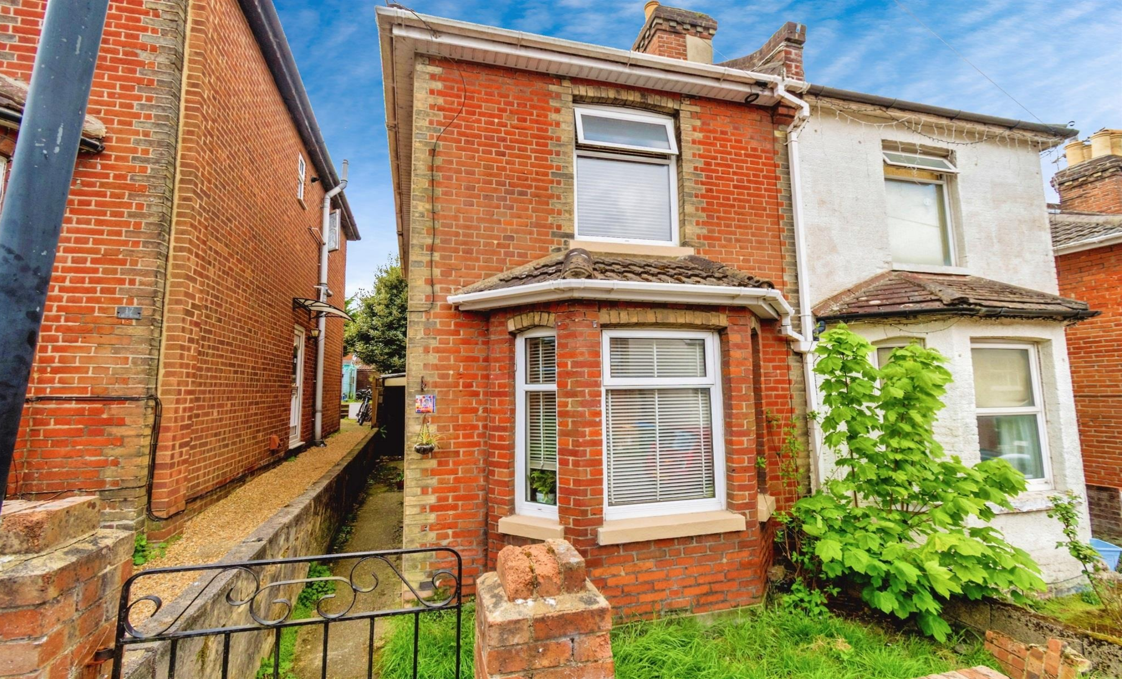
Lake Road Southampton