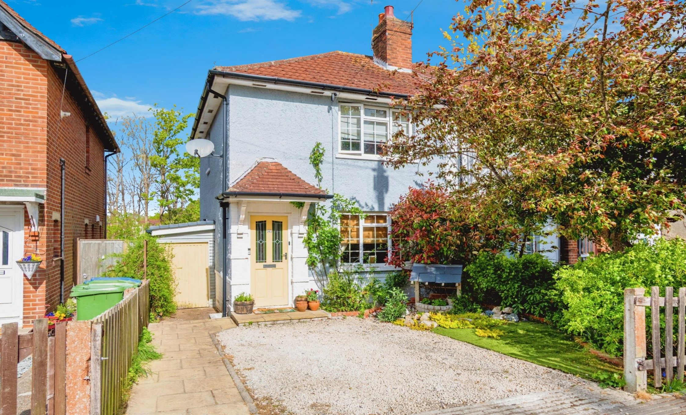
Blackthorn Road Southampton