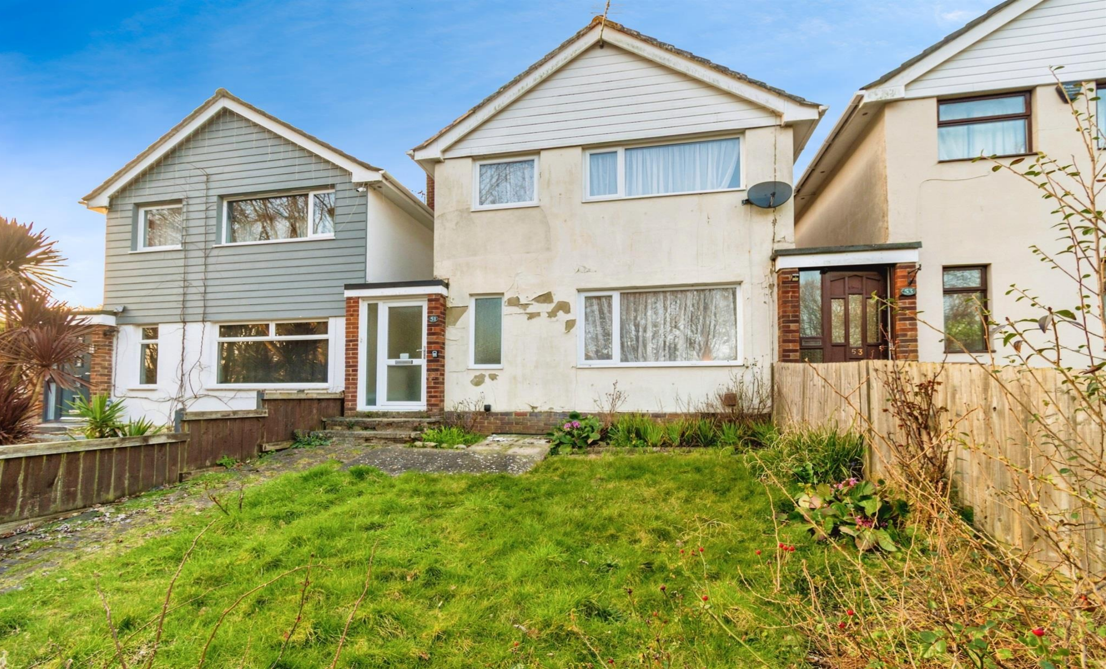
Alfriston Gardens Southampton