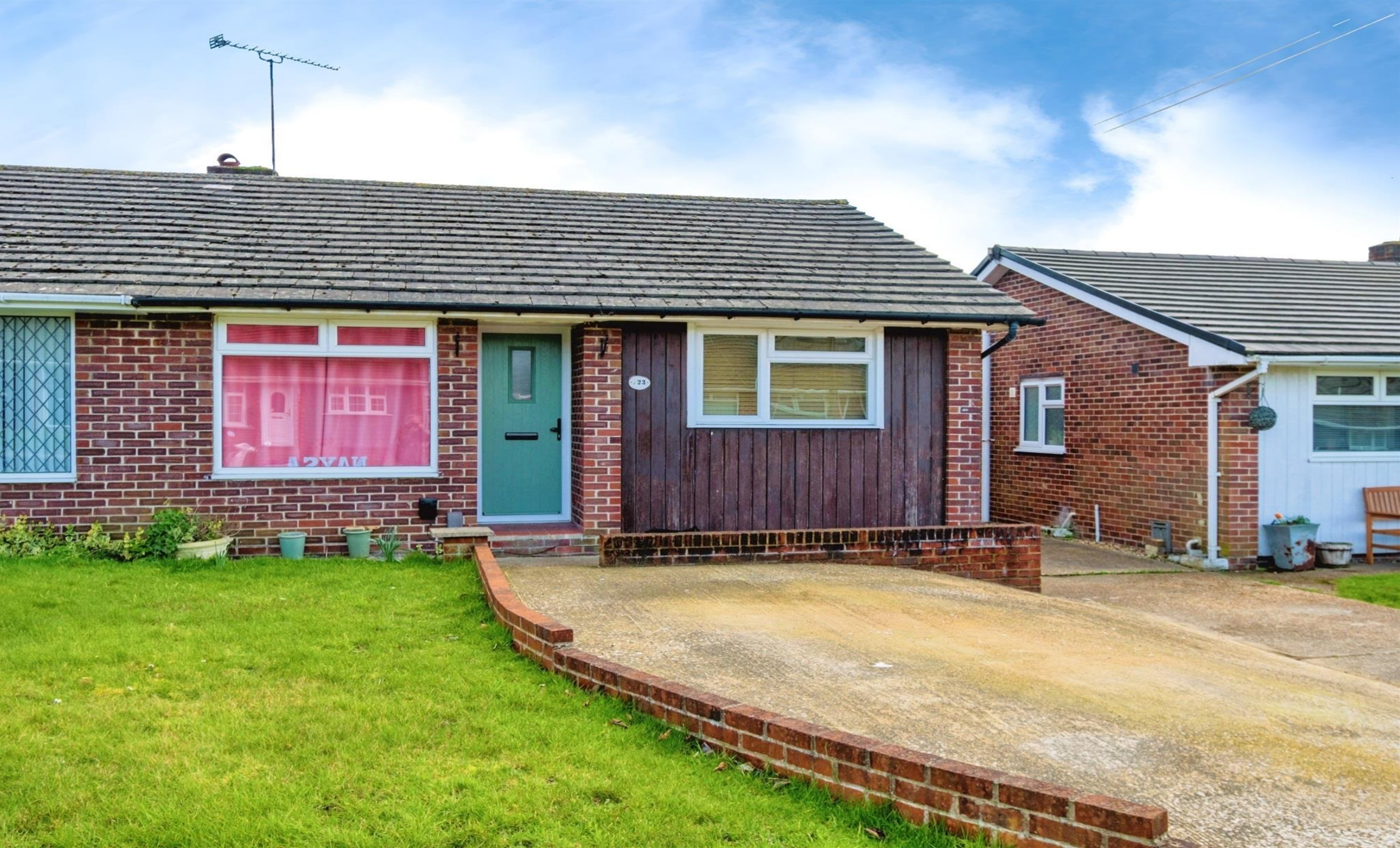
Maryland Close Southampton